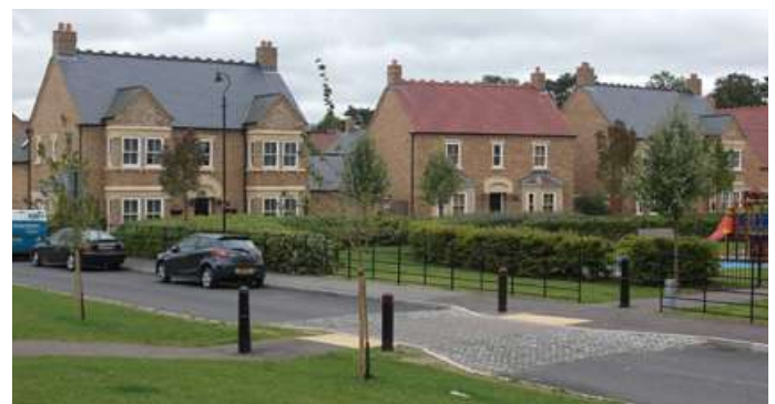
At Fairfield Park in Bedfordshire, vertical calming and 'pinch points' remind drivers they are in a 20mph zone

A pavement that has lots of variation in levels and dropped kerbs to enable cars to cross it can encourage unofficial parking up on the kerb and may make movement less easy for those pushing a pushchair, in a wheelchair or walking with a stick or walking frame.