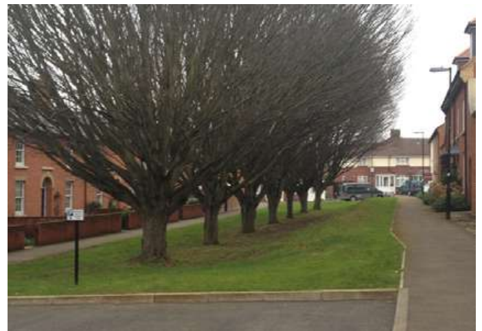
Existing mature trees on this site in Exeter add character and quality

Not carefully thinking about what balancing lagoons will look like and how people could enjoy them as attractive features within an open space network. Careful thought in the design process can eliminate the need for fenced off lagoons that are both unsightly and unwelcoming.