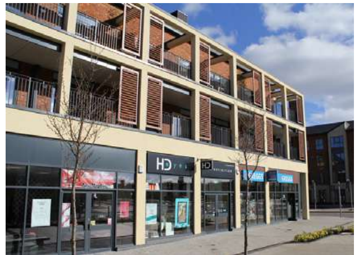
A mix of uses including homes, shops and other facilities in Lawley, Telford

Creating new places within a development where people can meet each other such as public spaces, community buildings, cafes and restaurants. Aim to get these delivered as early as possible. Think carefully about how spaces could be used and design them with flexibility