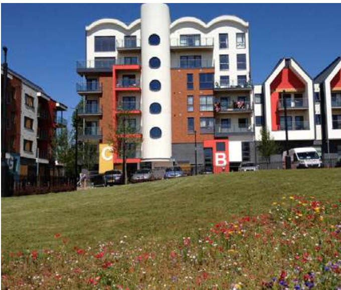
Architecture and green space works together to generate character in Bristol

Identifying whether there are any architectural, landscape or other features , such as special materials that give a place a distinctive sense of character as a starting point for design. It may be possible to adapt elevations of standard house types to complement local character.