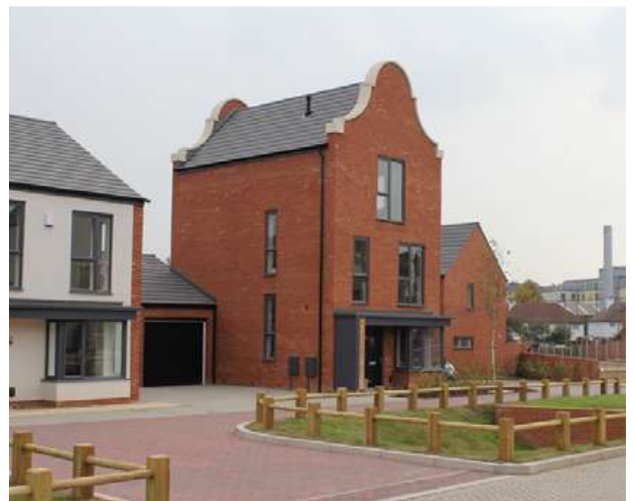
Marker buildings and spaces can help people create a 'mental map' of a place (Manor Kingsway, Derby)

Terminating views down streets with garages, the rear or side of buildings, parking spaces, boundary fences or walls.